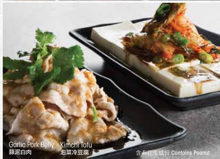
Garlic Pork Belly 蒜泥白肉 Kimchi Tofu 泡菜冷豆腐 含有花生成份 Contains Peanut