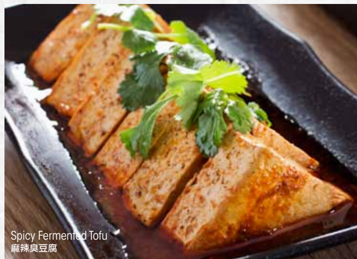
Spicy Fermented Tofu 麻辣臭豆腐